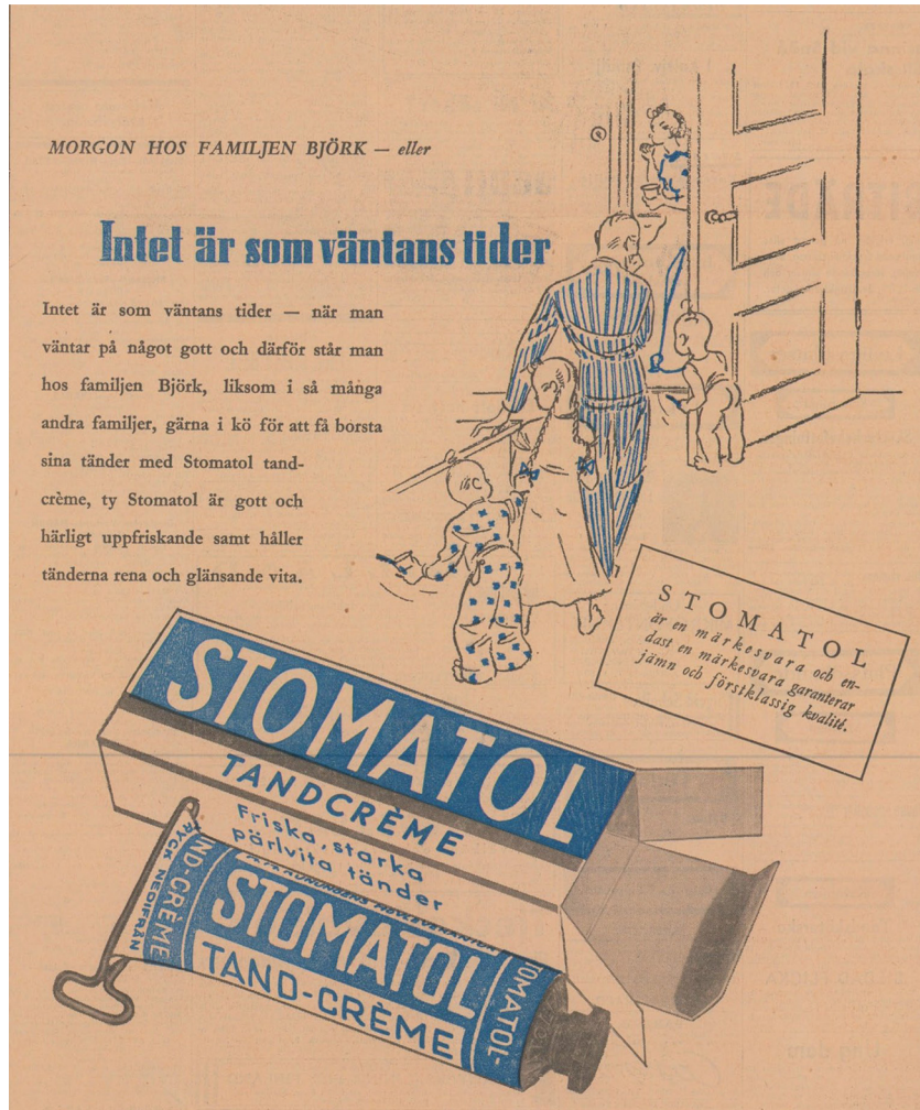
Figure 8. Family Life and Queuing, Svenska Dagbladet, 14th November 1937, p. 32

recontextualised humorously. Thus, it directly appeals to Swedish consumers, leaving little space for them to argue against the advice and message given.