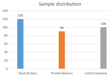
Figure 2. Sample distribution among different professions

In this research, behavioural biases are taken as the dependent variable, which included representativeness, overconfidence, anchoring, gambler's fallacy, availability bias, loss aversion, regret aversion, mental accounting, and herding bias. The questions related to these biases contain 29 statements, measured using the ordinal five-Point Likert Scale (Strongly disagree to Strongly Agree).