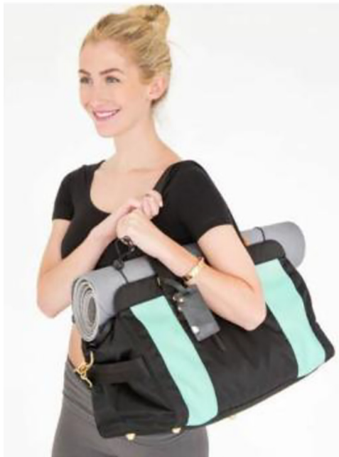
Plate 2. The Persu Bag – ease of carrying