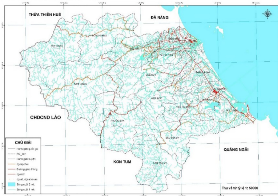
Figure 1. Map of river system in Quang Nam Province

Quang Nam is a coastal province in the key economic development region of the Central of Viet Nam (Figure 1). The total natural area of the province is 1,043,836.96 ha. Quang Nam currently has 18 districts and cities, in which, there are two big cities: Tam Ky and Hoi An. Quang Nam plays an important role in the exchange of goods between the South and the North of Viet Nam via National Road 1 A and Ho Chi Minh Road. In addition, Quang Nam also plays an important role for goods exchange between provinces in the Central region and Central Highlands of Viet Nam. The west of province borders with Laos, which is a