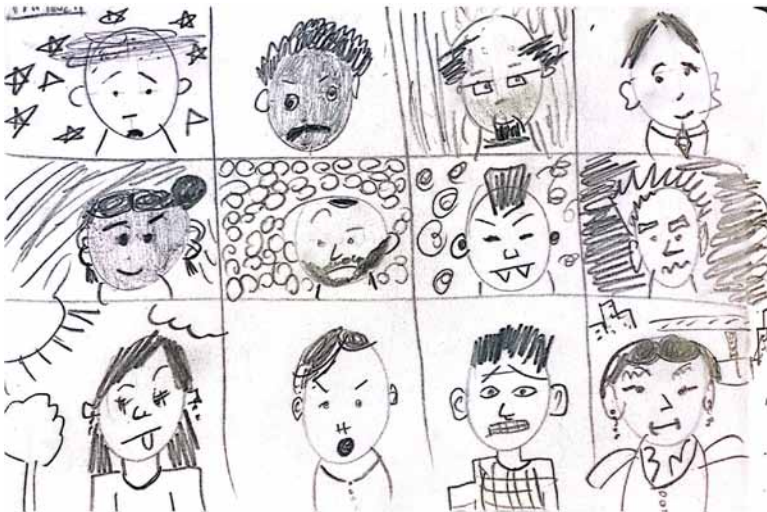
Fig. III. Hypothetical Readers.

And these are the hypothetical readers (Fig. III) I want to thank in advance for joining me on this venture!