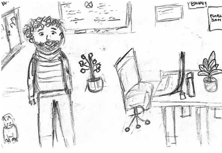
Fig. II. The Person Who Supported Me the Most.

And, as is expected in most publications, I thank the person who supported me the most (Fig. II).