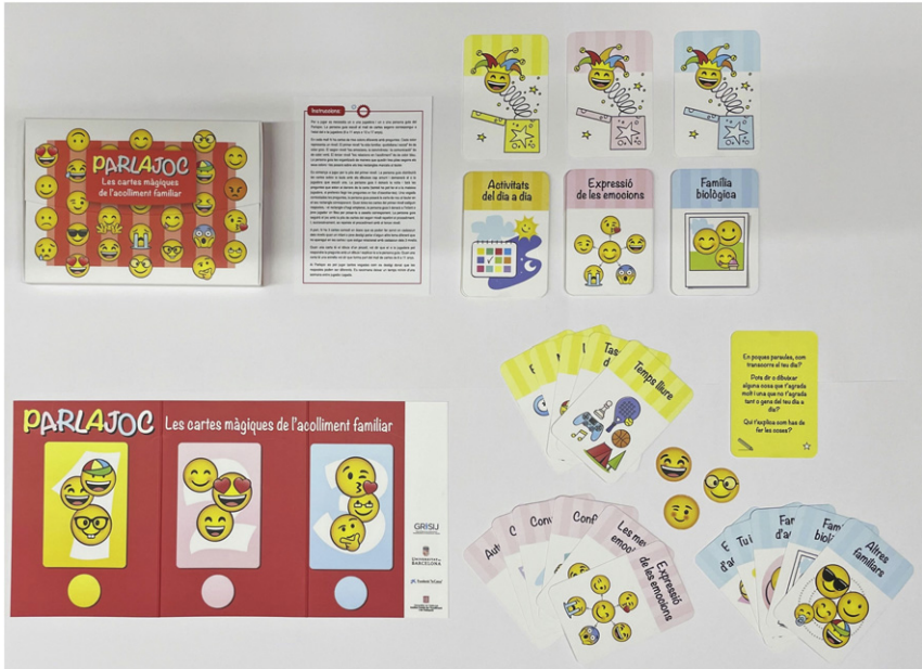
Fig. 6.1. The Materials From the ‘Play&Talk’.

four questions: ‘Do you like being with your foster family?’ ‘Who do you consider part of your foster family?’ ‘What makes you feel part of your foster family?’ and ‘Do you think that you are important for your foster family?’