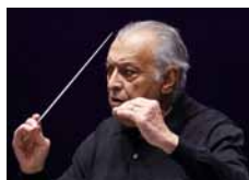
Maestro Zubin Mehta.

Music Director Emeritus, Israel Philharmonic Orchestra Conductor Emeritus, Los Angeles Philharmonic