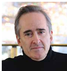
Maestro James Conlon.